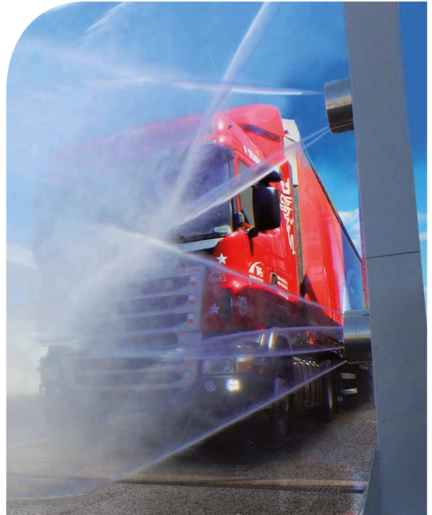
ISTOBAL HW'ROTATORS The only motorised system in the market